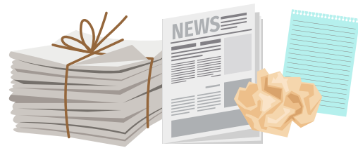
Newspaper, Paper, Office/Mixed Paper