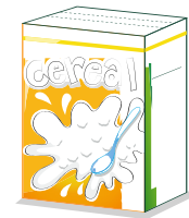
Paperboard no frozen food boxes