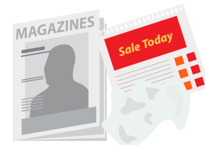
Magazines & Junk Mail