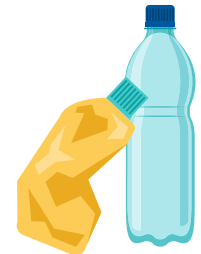
Bottles, Tubs, Jugs (w/ lids attached)