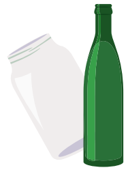
Glass Jars & Bottles w/out lids